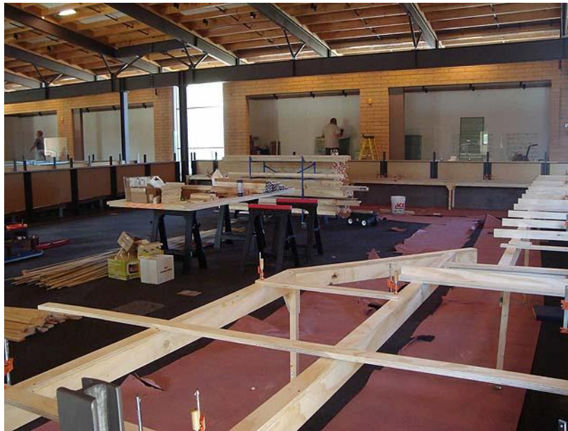
IN THE BEGINNING - 32 X 40 FEET OF OPEN SPACE

Ground breaking in February, 2010 for the Model Railroad Building became the fulfillment of a ten year dream for the park staff and the three clubs, Sun-N-Sand, SMRHS and Paradise & Pacific O gauge. The building was nearly complete when it was briefly opened to the clubs and the public for Rail Fair in October, 2010. Over 4,000 people visited the building over two days. Then the building remained closed for three months while contractors completed their work and the three clubs began their layout construction. January, 2011 saw the dedication of the Model Railroad Building and its formal public opening. Over 150,000 park visitors enjoyed the sights and sounds of the model railroads, displays and videos in the first twelve months.