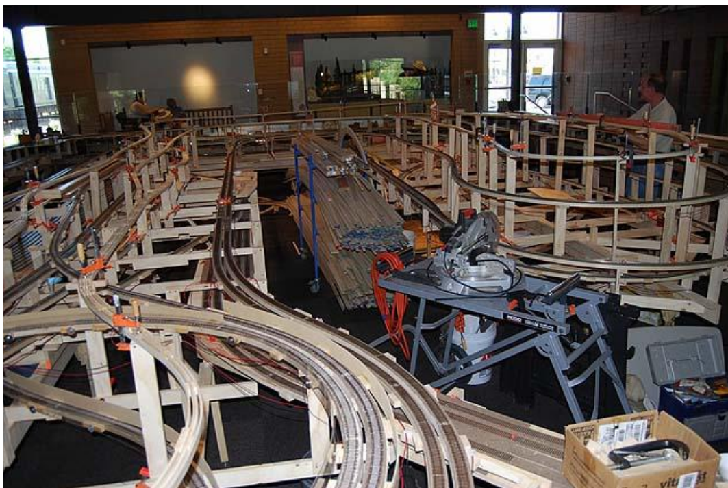
A LOT OF TRACK - NOT MUCH SCENERY

Ground breaking in February, 2010 for the Model Railroad Building became the fulfillment of a ten year dream for the park staff and the three clubs, Sun-N-Sand, SMRHS and Paradise & Pacific O gauge. The building was nearly complete when it was briefly opened to the clubs and the public for Rail Fair in October, 2010. Over 4,000 people visited the building over two days. Then the building remained closed for three months while contractors completed their work and the three clubs began their layout construction. January, 2011 saw the dedication of the Model Railroad Building and its formal public opening. Over 150,000 park visitors enjoyed the sights and sounds of the model railroads, displays and videos in the first twelve months.